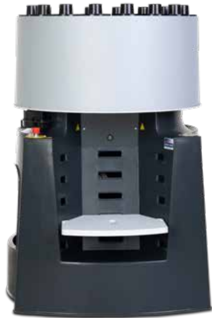
Wrap not included in standard offering

Its tubeless design reduces wastage, making it a cost-effective, cutting-edge dispenser with low maintenance and operational simplicity for reduced capacity.